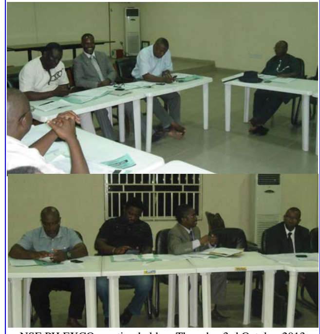
NSE PH EXCO meeting held on Thursday 3rd October 2013

Date: October 7-11, 2013 Venue: De-Lumen Hotels & Suites, No 3, Bent Lane, GRA, Onitsha, Anambra State.